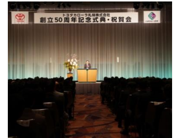
50th anniversary commemorative ceremony and celebration party