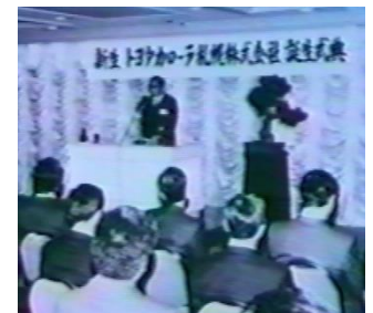
Merger celebration ceremony