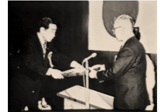
"TOYOTA Special Award ceremony"